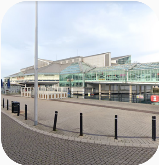
Princes Dock Street