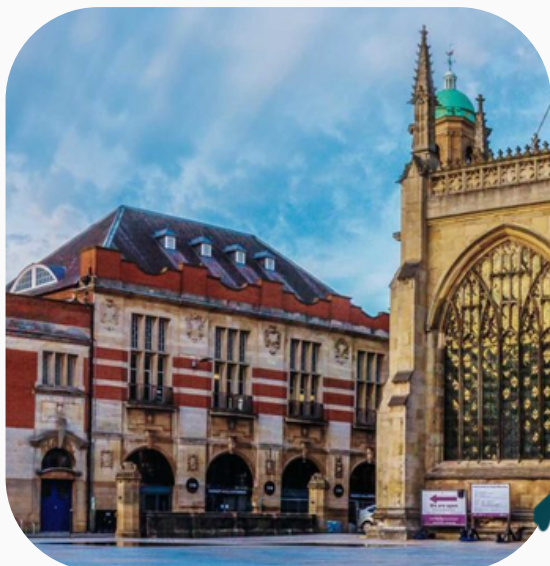
Trinity Square and Market